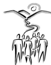
Walk to Emmaus

Those who are to attend this event received a letter with scheduling information.