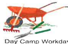
Day Camp Workday

Saturday, June 10 th 9:00 -11:00 am 455 Country Club Road Jr. Counselors Call Lyn Blount @ (903) 237-8019 For more info.