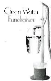
Clean Water Fundraiser

Call the church office or Lyn B. for more info.